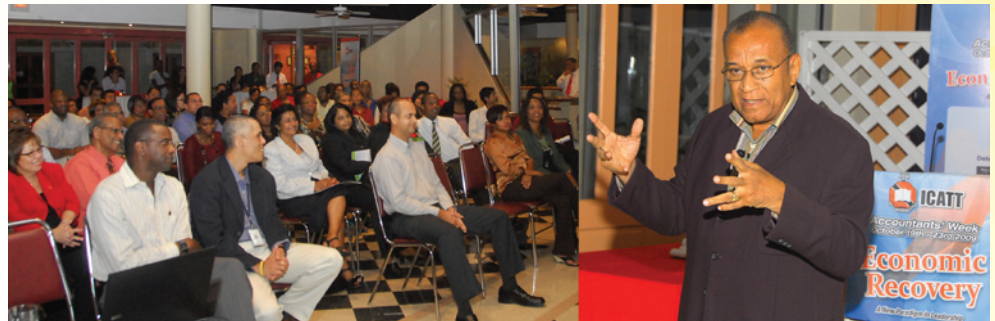
Participants enjoy an entertainment piece at the Members' Cocktail reception marking the close of Accountants' Week 2009