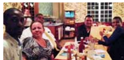
Members of the ICAC Executive team meet with representatives from the ICA-Belize council during a visit to Belize in September 2015.